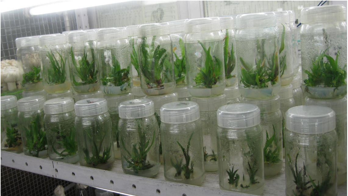
Shoot culture on large scale