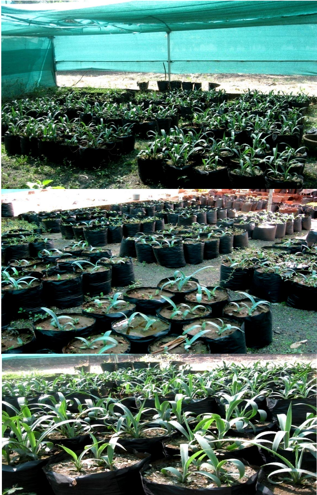
Acclimatization of plantlets